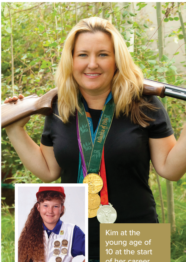
Kim at the young age of 10 at the start of her career, and wearing her Olympic medals.

KIM RHODE began her competitive shooting career at age 10 and won her first Olympic gold medal in 1996 at age 17. She went on to win Olympic bronze in 2000 and gold at the 2004 Olympic Games. When the Olympics eliminated double trap shooting, Kim switched to skeet and won a silver medal in 2008, gold in 2012 and bronze in 2016. She is the most successful female Olympic shooter ever. She enjoys public speaking, giving shooting demonstrations, skiing and hunting, and is an avid builder and restorer of cars. She has studied veterinary medicine and in 2013 had her first child, a son. The following essay is a personal account of what the shooting sports has meant to Kim and her family.