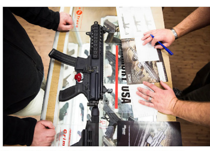
The country's financial giants hold more sway over the gun industry than any politician. If banks and credit card companies were to stop doing business with gun shops that sell assault weapons, the supply of such firearms would be greatly reduced.