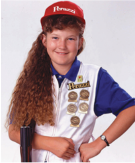
At the young age of 10, at the start of her career, and wearing her Olympic medals.