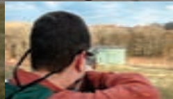
Halfway from middle of trap house and right corner; 2 – 2½ feet high*