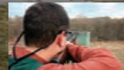
Right-front corner of trap house; 2 – 2½ feet high*