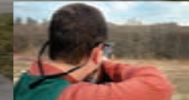
1 – 1½ feet to the right of the trap house; 2 – 2½ feet high*