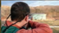
Middle of trap house; 1 – 1½ feet high*