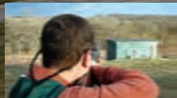
Halfway from middle of trap house and left corner; 1 – 1½ feet high*